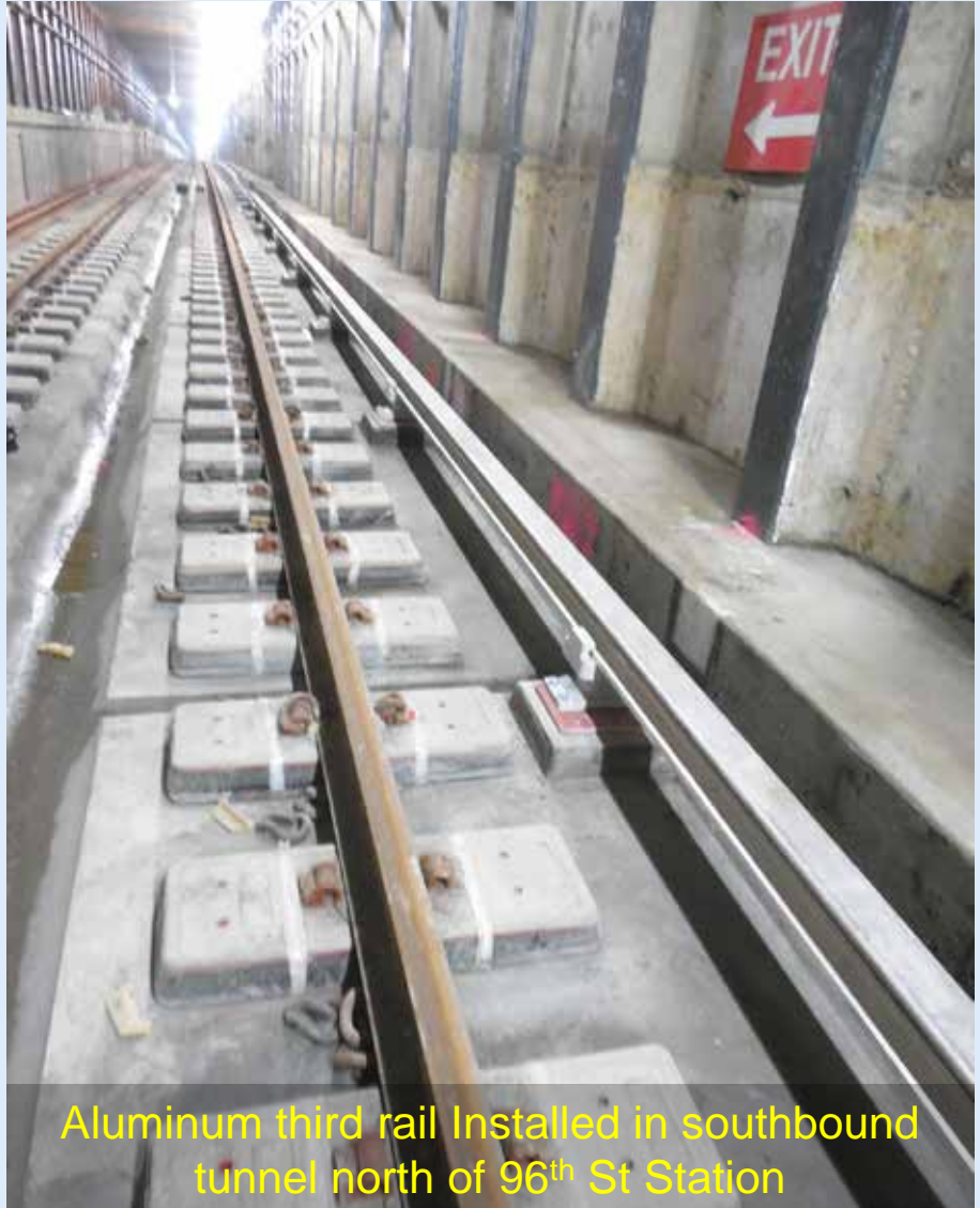
Aluminum third rail Installed in southbound tunnel north of 96 th St Station