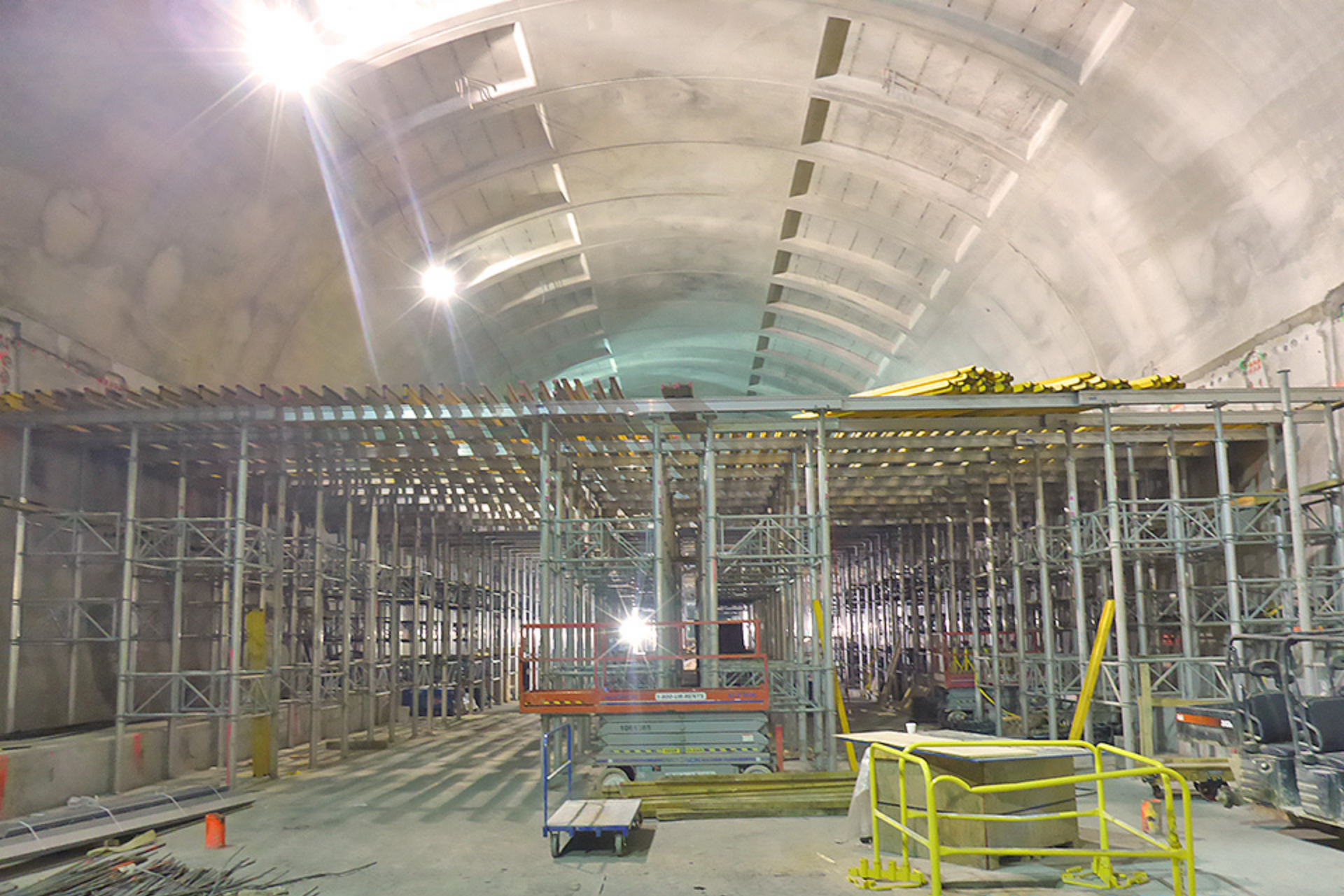
86 th Street Cavern Mezzanine Progress- August 2014