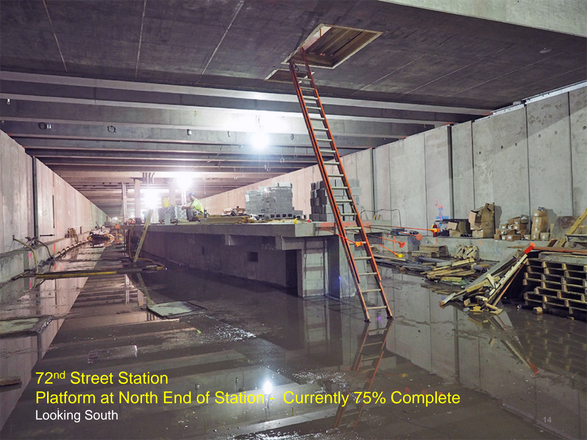
72 nd Street Station Platform at North End of Station - Currently 75% Complete Looking South